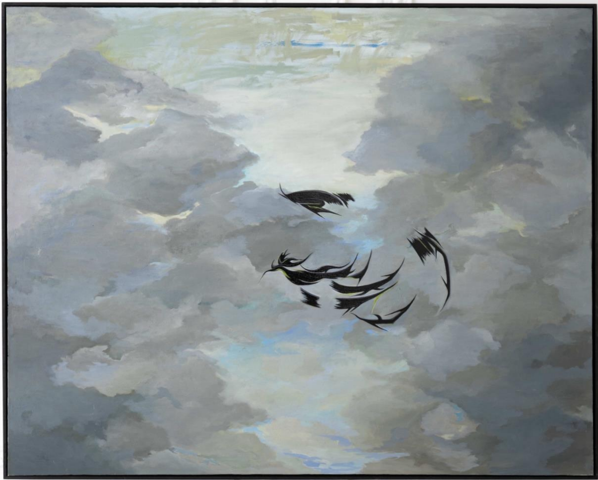
Ucherie Angel Organism , 2021 Oil on canvas 152 x 122 x 5 cm SOLD