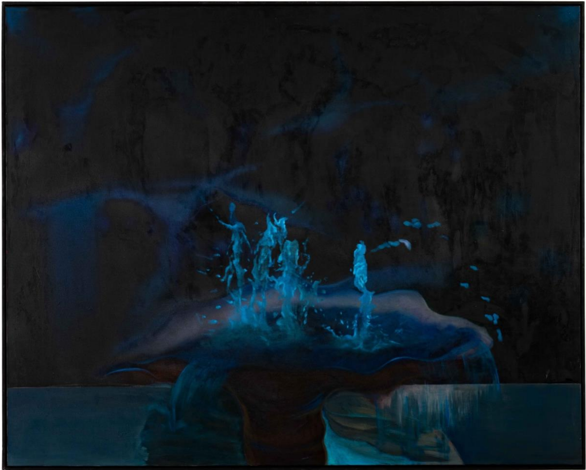
Uchercie Synecdoche of Construction , 2021 oil on canvas 152 x 122 x 5 cm