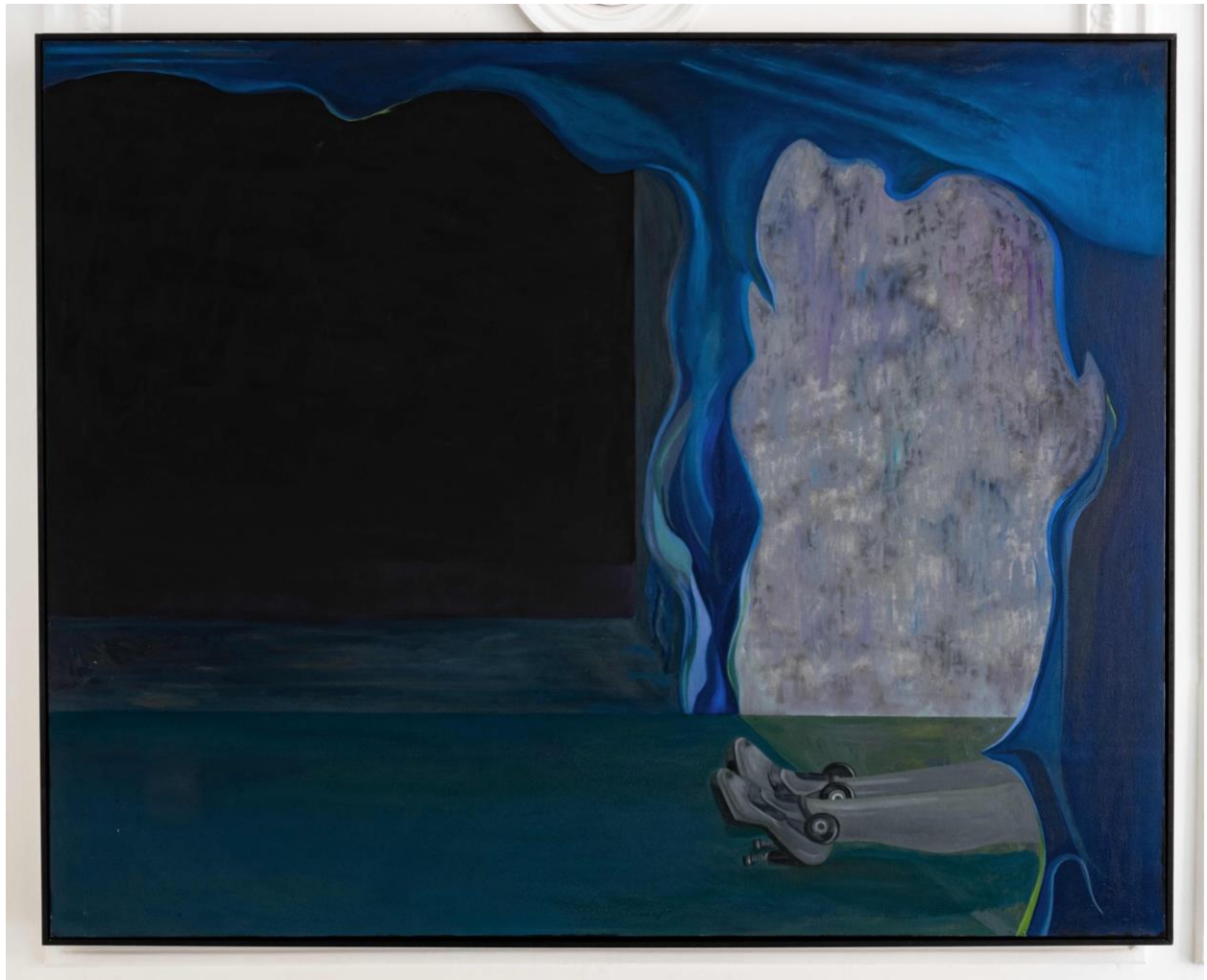
Uchercie Cybernetic Syntax in Limbo , 2021 oil on canvas 152 x 122 x 5 cm