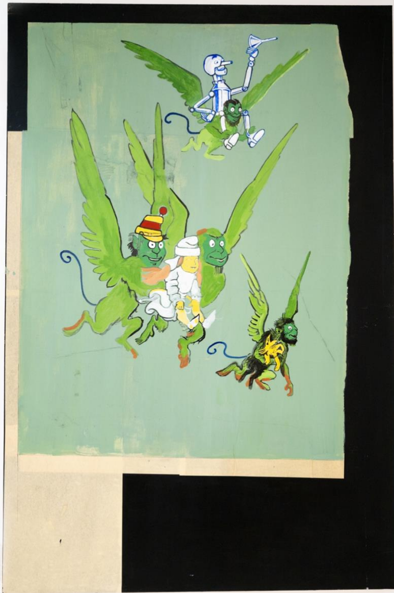
Write Me or Ride Me (after W.W. Denslow), 2020 Acrylic paint and paper on board 39in x 59in 100 X 150cm