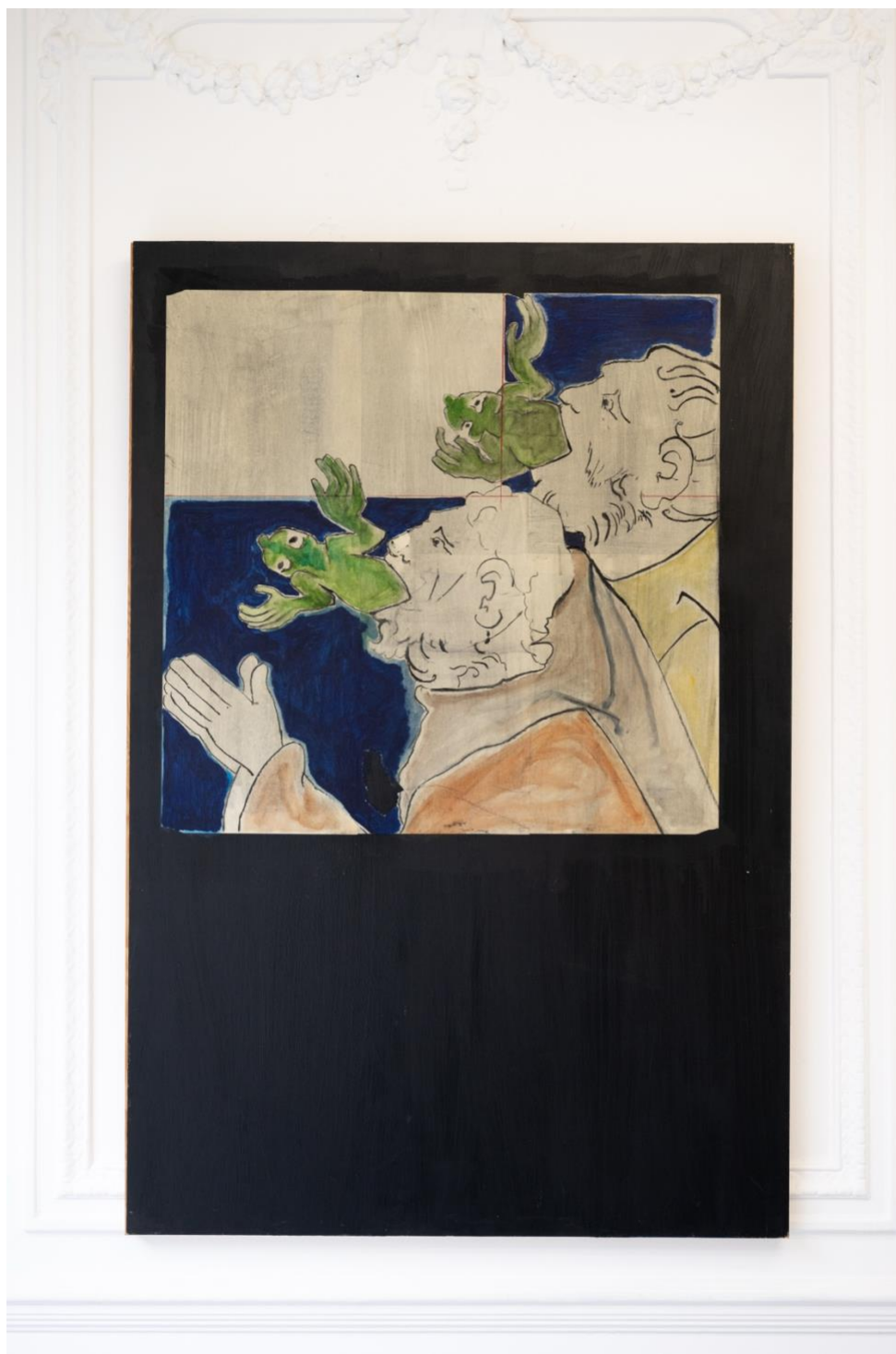
F for Fake, 2020 Acrylic paint, pencil and paper on board 39in x 59in 100 X 150cm