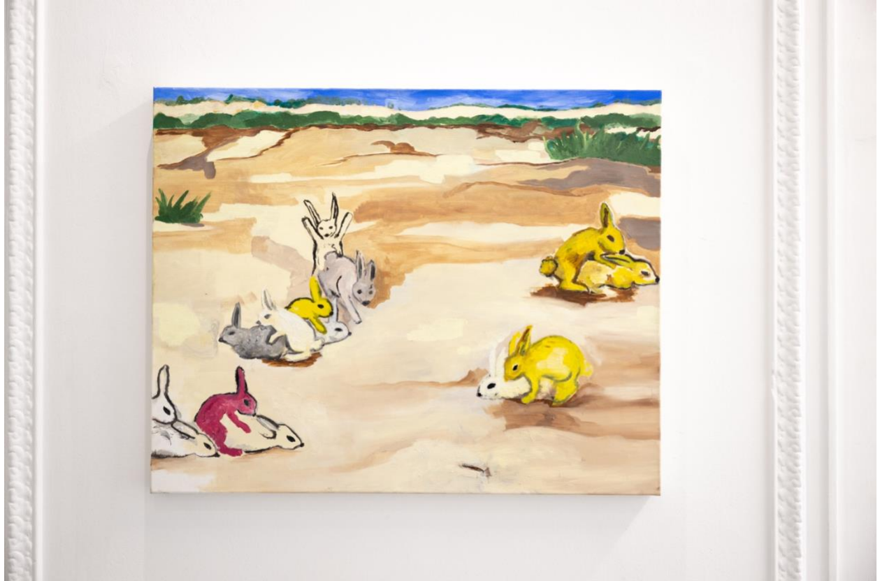
Untitled (Bunny Conference), 2021