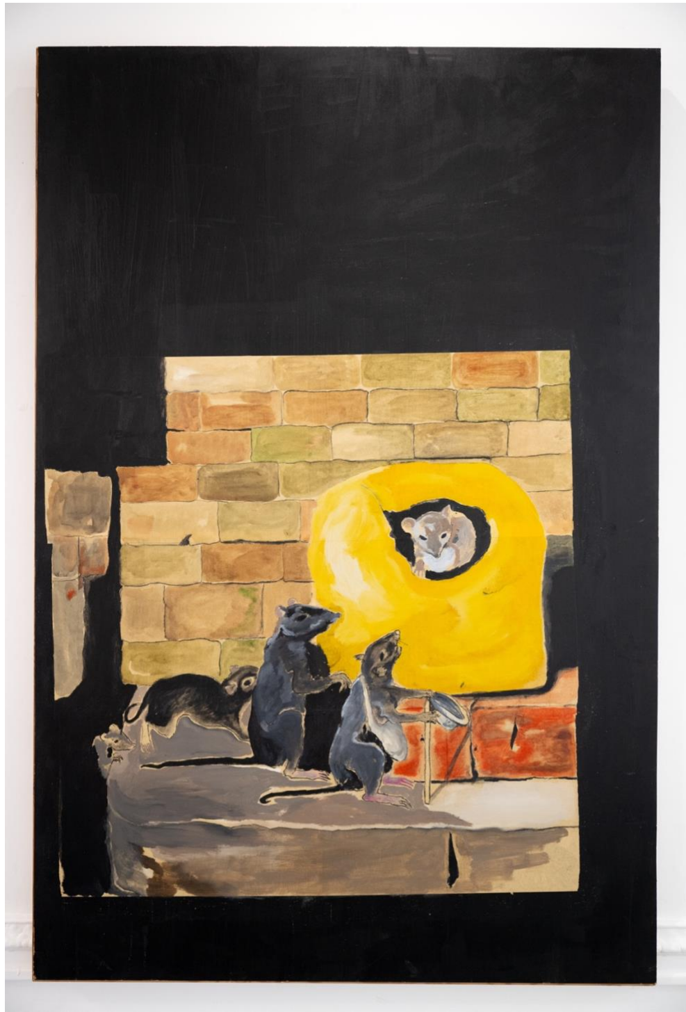
Secret Location , 2020 Acrylic paint and paper on board 39in x 59in 100 X 150cm