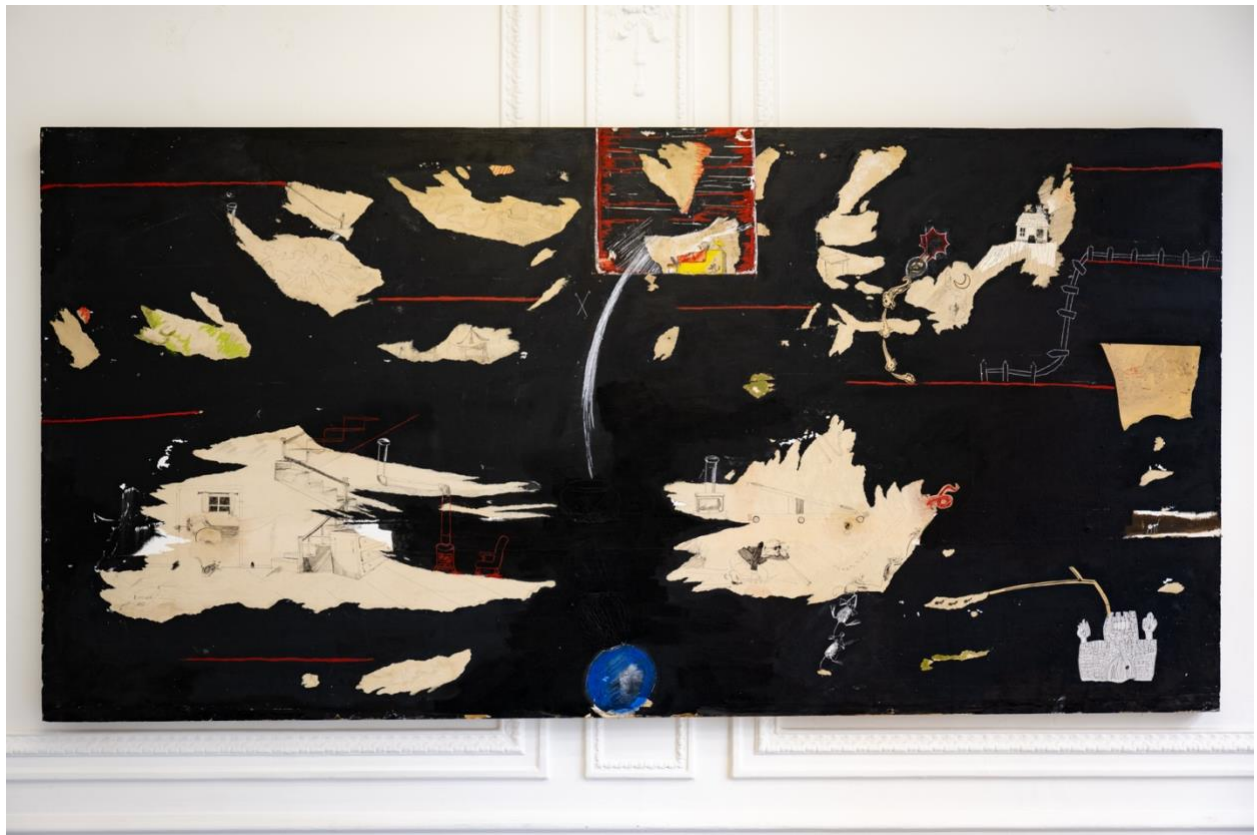
Restless Workers Sleepy Heads, 2020 Pencil, pen and soft pastels on found board 96in x 48in 244cm x 122cm