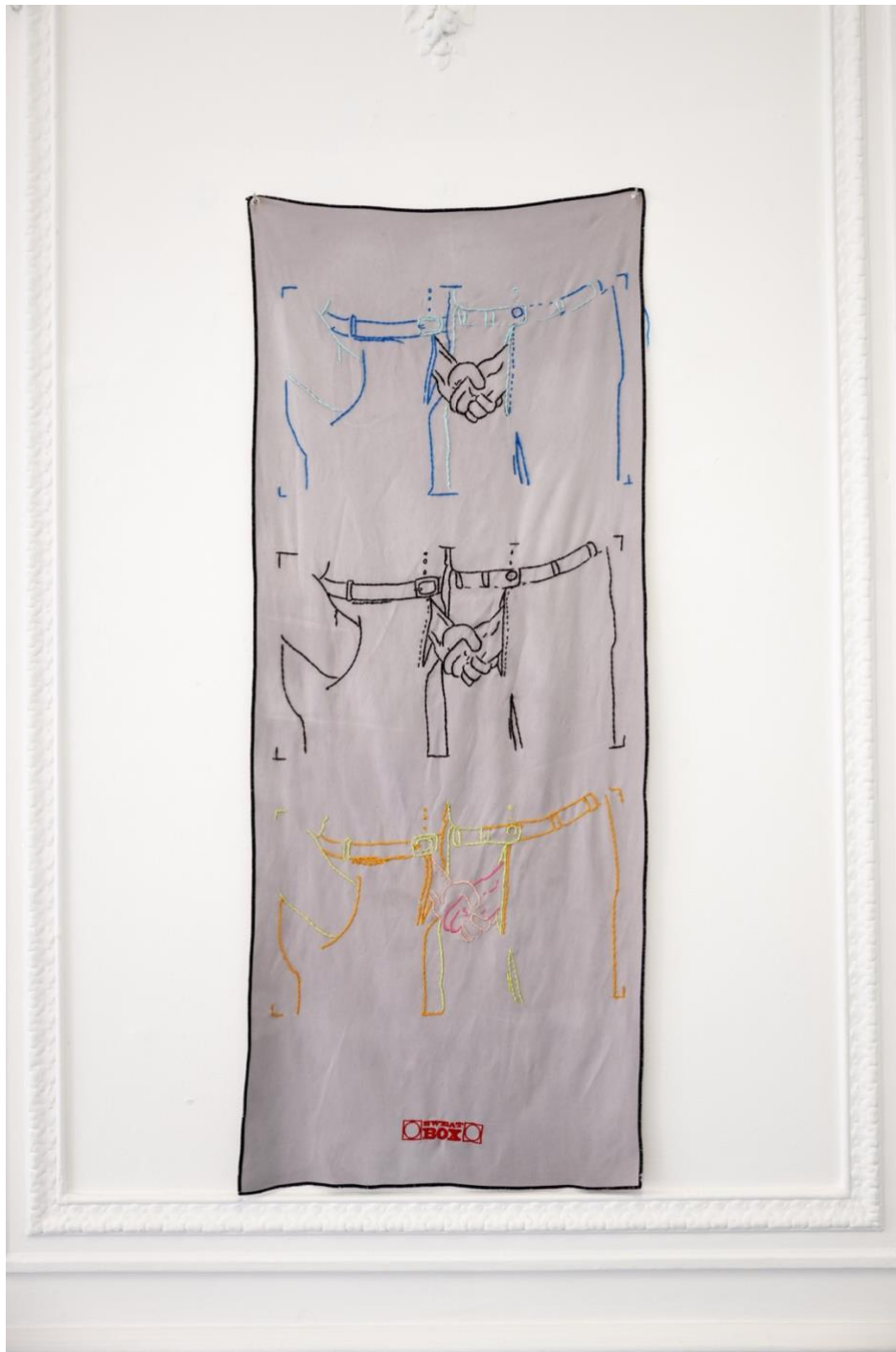
Before I forget, Teleny Sweats, Albeit Covertly, Elsewhere, 2023 Embroidery on found towel 21.5in x 53in 54cm x 135cm