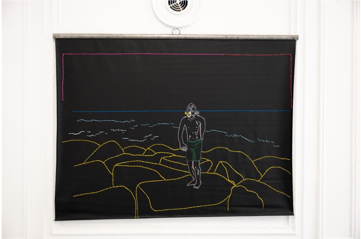
The Smell of Blue , 2022 Embroidery on pleather 56in x 44in 142cm x 112cm