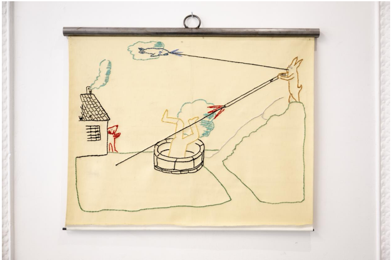
Vanishing point , 2021 Embroidery on pleather 28in x 24in 71cm x 62cm