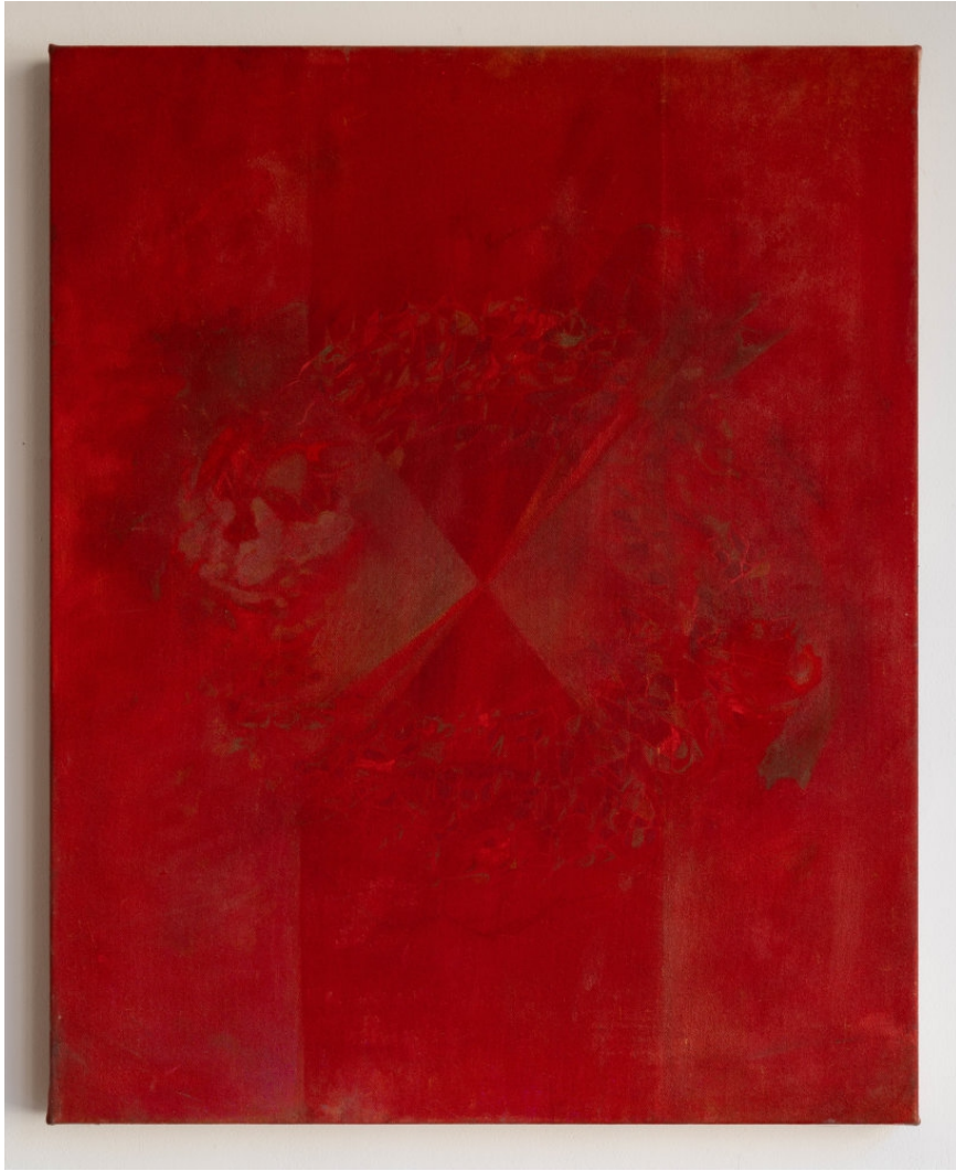
Arthur Poujois Fast Red Dust Imprint of Four Expanding Time Zones, 2022 Oil on cotton 81 x 50 cm