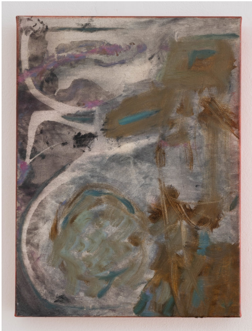
Arthur Poujois Le Raconteur , 2024 Oil, ink and pastel on cotton 30 x 40 x 4 cm