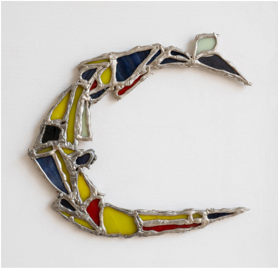
Arthur Poujois Moon Disc , 2021 Recycled cathedral glass, solder 20 x 17 cm