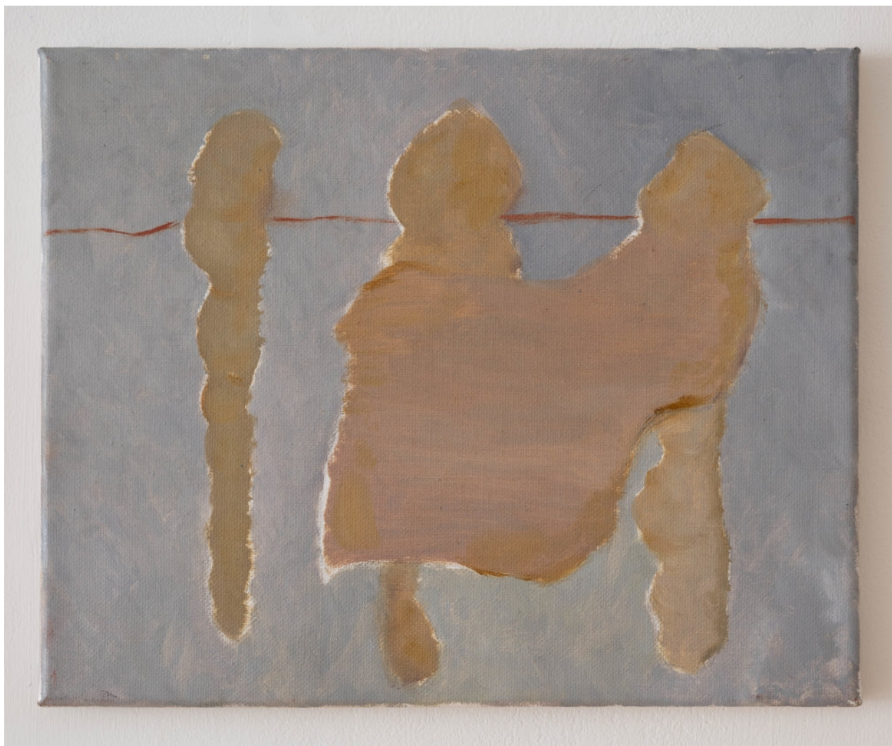
Arthur Poujois Le plaisir , 2024 Oil on cotton 30 x 24 cm