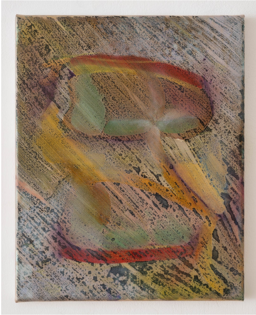
Arthur Poujois Lightning SDIA, 2024 Oil, ink and pastel on cotton 24 x 30 cm