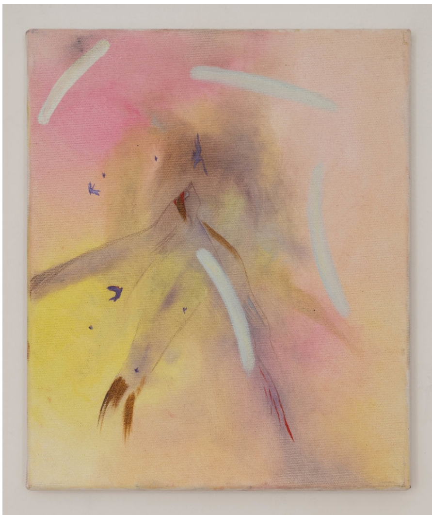
Arthur Poujois Intuition Axis , 2024 Oil on canvas 26 x 31 cm