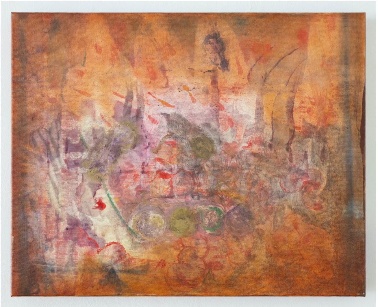
Arthur Poujois Infinity Cityscape Burning in a Strange Loop , 2024 Oil, ink and pastel on cotton 51 x 41 cm