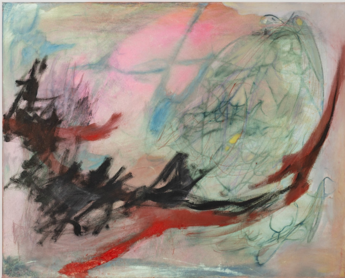
Arthur Poujois The Opportunity (Perfect Void) , 2024 76 x 61 cm