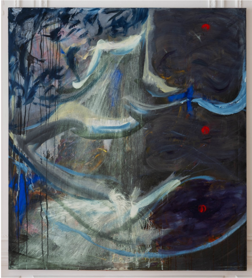
Arthur Poujois Parallax (Eaux d'Artifice) , 2024 Oil, clay, dry pigments on cotton 150 x 130 cm