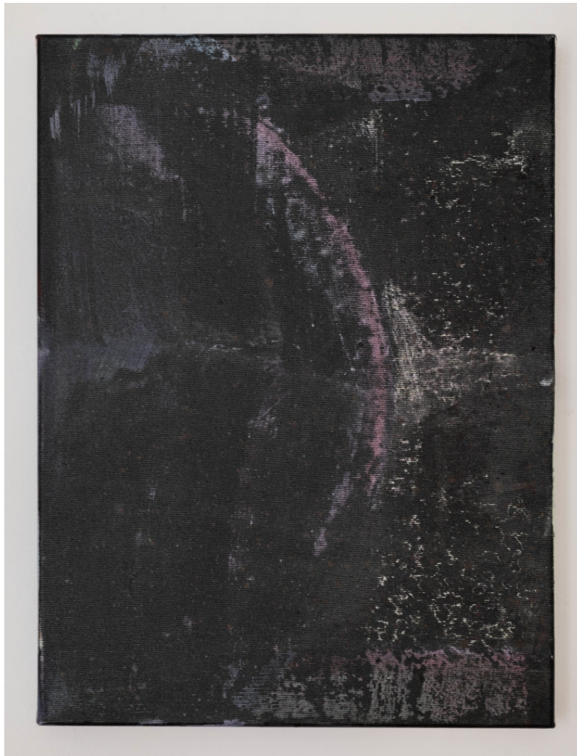
Arthur Poujois Outward Envelope of a Deeper Difference (Styx) , 2024 Oil and ink on cotton 30 x 40 x 4 cm