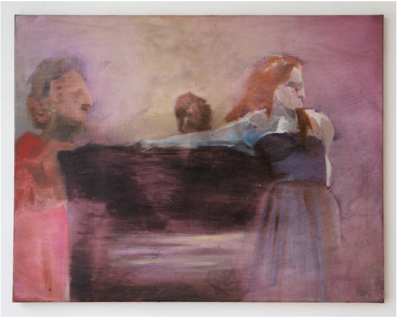
Arthur Poujois Everything Began There (Pina) , 2024 Oil on Canvas 90 x 70 cm