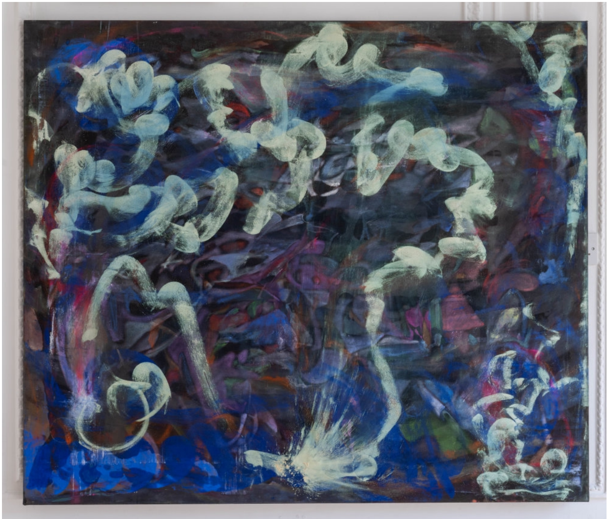
Arthur Poujois Finally One Movement, Like a Stone Thrown in Water, 2022 Oil on cotton 140 x 170 cm