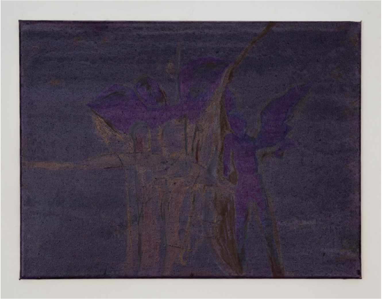
Arthur Poujois Mirroring Itself, 2024 Oil, ink and pastel on cotton 30.5 x 40.5 cm