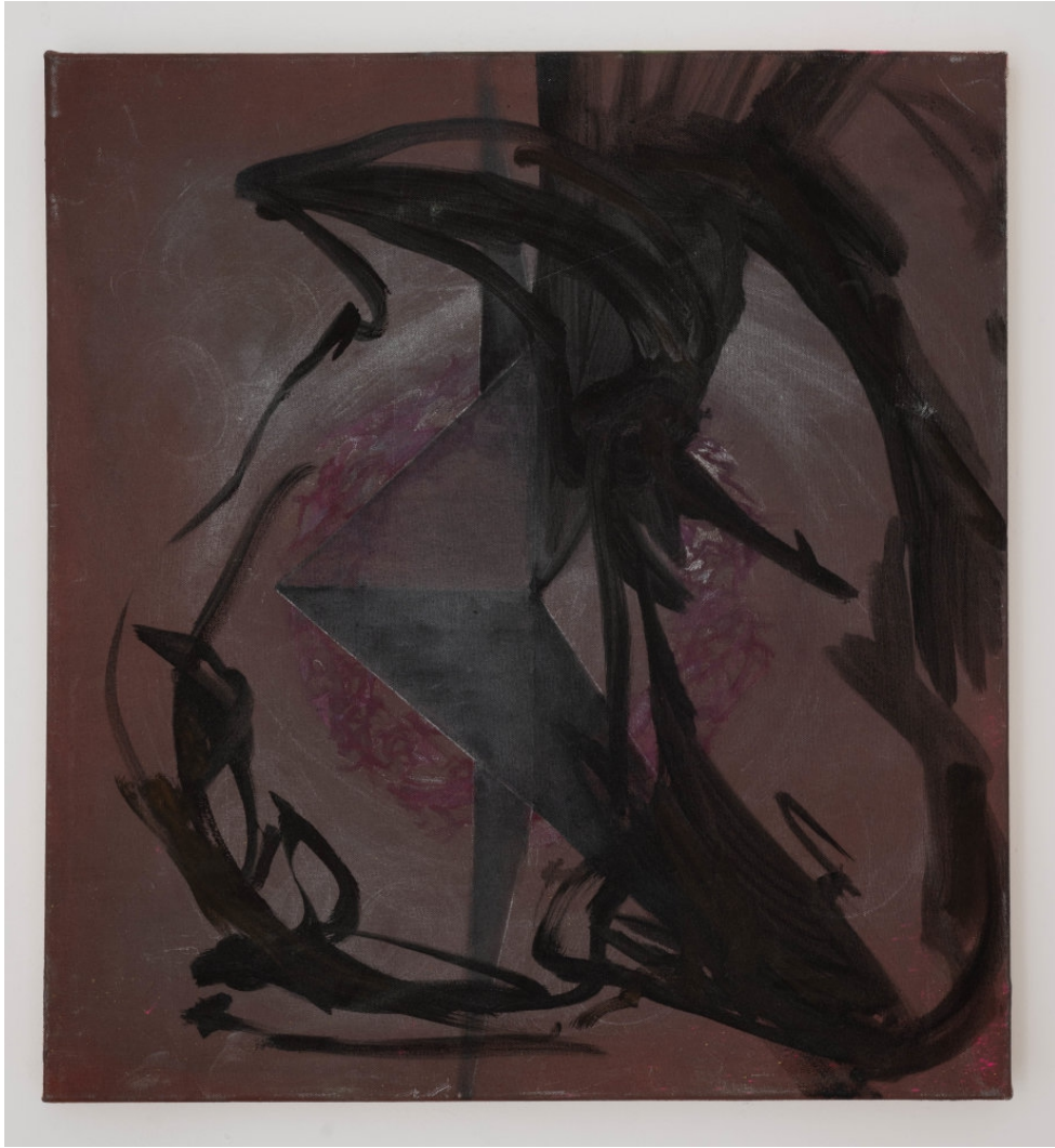
Arthur Poujois Animation Anime Dessin Animé , 2022 Oil on cotton 60 x 50 cm