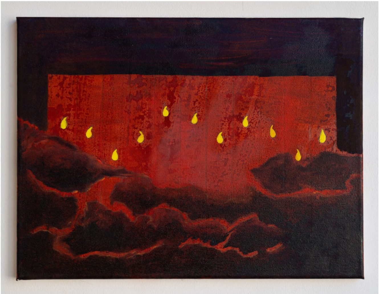
Arthur Poujois The Theatre and Its Double , 2024 Oil and ink on cotton 40.5 x 30.5 cm