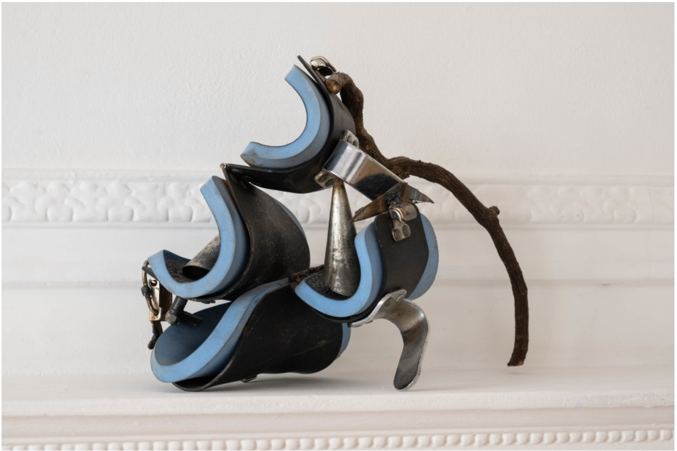
Arthur Poujois Nature, Encryption and Role Play, 2023 Metal, wood, rubber, polymer