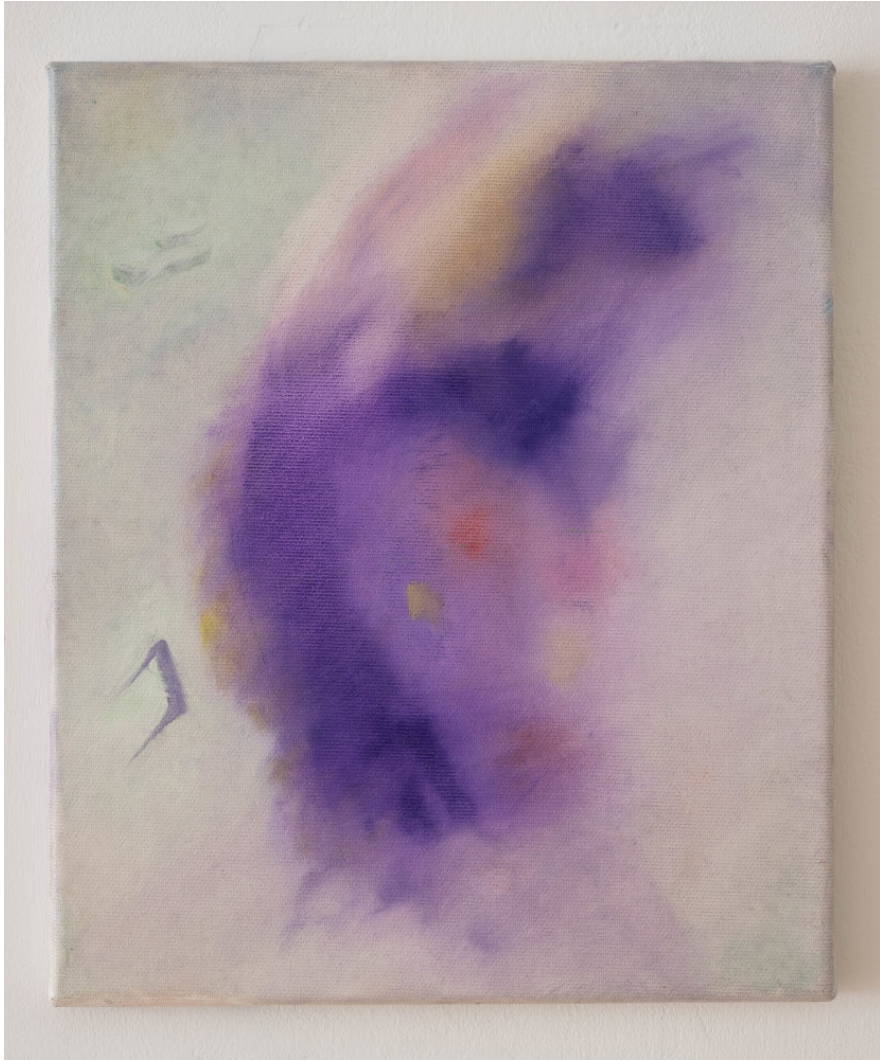
Arthur Poujois Gummo , 2024 Oil on cotton 26 x 30 cm